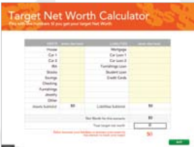
Widgets allow learners to play and experiment with outcomes.