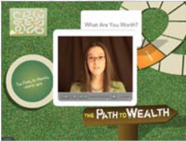
Peer-characters introduce and summarize each lesson using insights and humor.