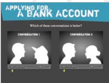
Some topics are underscored by simulated conversations.